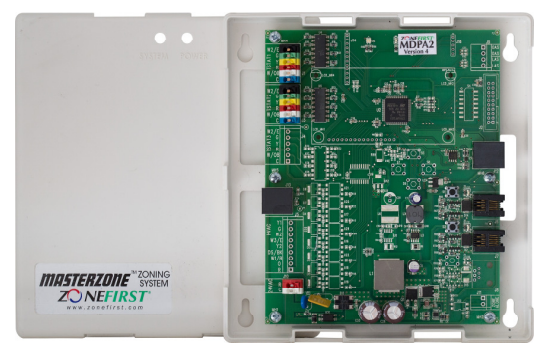
Model MDPA2 Ver. 4 Zone-Adder™

Systems Over Three Zones – The MDP3 Ver 4. is a two and three zone only panel and can be added on to by adding the MDPA2 Ver. 4. The MDPA2 Ver. 4 is a two zone adder control panel. Multiple MDPA2 Ver. 4 panels can be wired together in a "daisy chain" connecting one to another with an RJ45 Ethernet Cable, supplied with each MDPA2 Ver. 4. A total of 50 – MDPA2 Ver. 4 panels can be wired together to get up to 100 Zones additional to the MDP3 Ver. 4 for a total of 103 Zones.